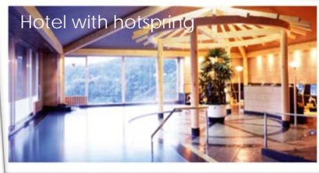
Hotel with hotspring

【More information】 Socio/Eco Environment Water Resources Research DPRI, Kyoto University kyoto.ecohydro@gmail.com