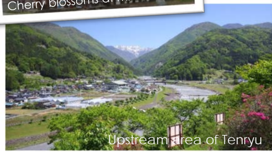
Upstream area of Tenryu