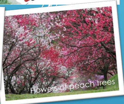
Flowers of peach trees