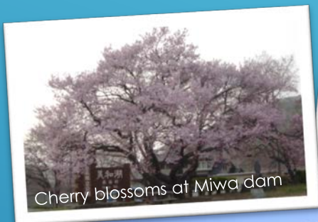
Cherry blossoms at Miwa dam